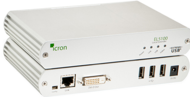
LEX (Local Extender)

The EL5100 extends both DVI and USB 2.0 up to 100m using a single Cat 5e* cable.